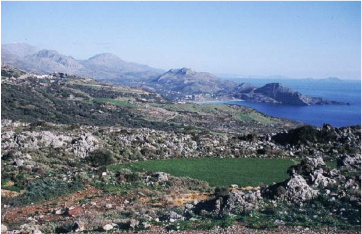
The Island of Crete