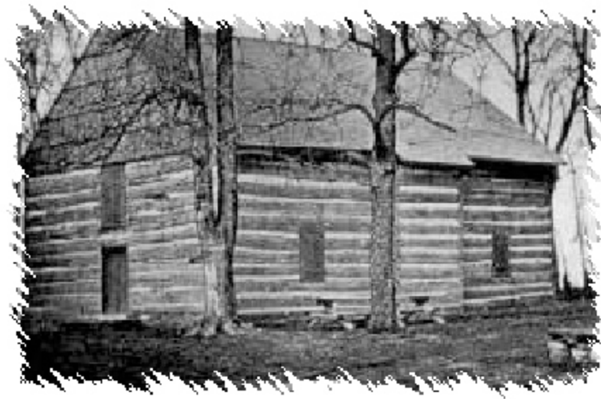
Cane Ridge Meeting House